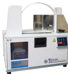
CE-240 Table Top