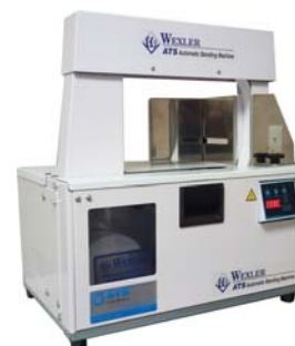
CE-240 Table Top with lifter attachment